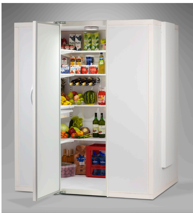
There are 4 x free standing sizes available

Free standing units in 4 x 'off the shelf' sizes are also available.