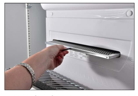
Keep filter flat and pull out gently.