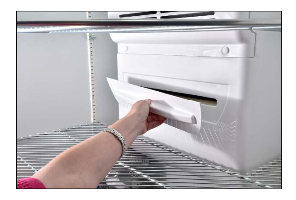
Remove the filter cover.