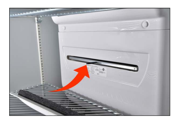
Locate the tab to remove filter.