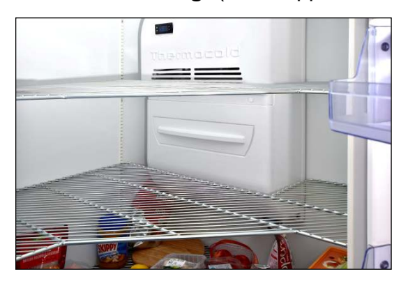
Make space in front of the unit.