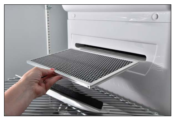
Remove filter, use hoover with soft brush to clean grill. Refit filter.