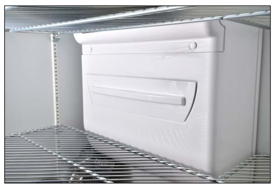
Replace filter cover and fridge contents.